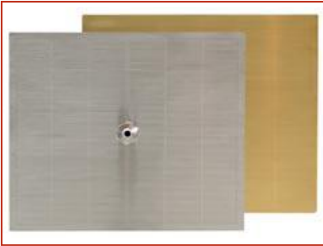
Sieve with 6 rows of slots