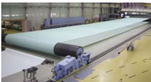
Quality control in fabric production.

The quickly obtained full-width profiles will help to increase the control on production processes like weaving, heat-setting and grinding. The supplied software includes a FFT analysis tool to capture repetitive variations.